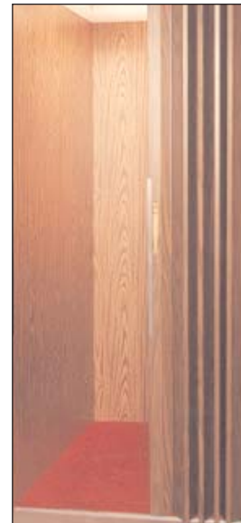
Oak laminate interior with woodfold gate

For more information on the products we manufacturer or pricing, please contact a Sales Representative today at (734) 246-4700 or visit us on the web.